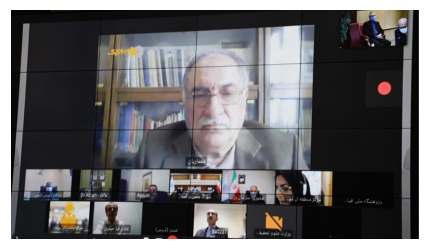
"Second Meeting of the Coordinating Council of International Organizations and Assemblies" on 4 January 2021

- The Chair holder participated in the "Second Meeting of the Coordinating Council of International Organizations and Assemblies" on 4 January 2021 and gave a lecture.