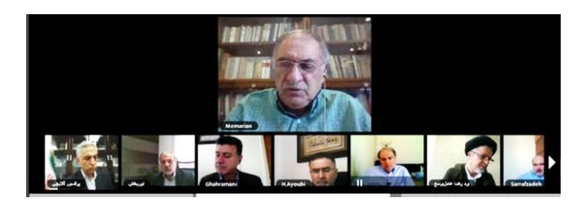
Joint meeting of UNESCO Chairs of Tehran University; 12 May 2020

held on 12 May 2020 and 13 January 2021 and gave a lecture on UCEE's activities and outcomes.