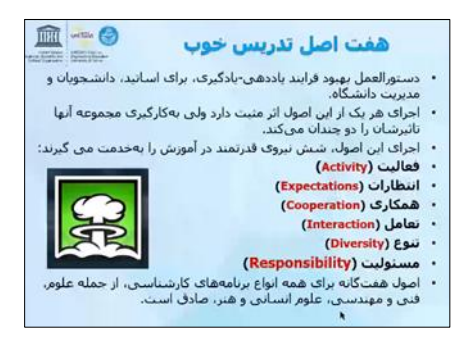
Shahid Beheshti University. 10 August 2020-

The chairholder presented a lecture on the mechanism of student-centered education, for the faculty members of Shahid Beheshti University, Tehran (10 August 2020).